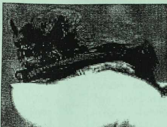
The common pipistrelle