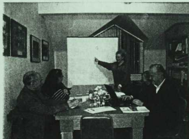
A group of Area Assessors at the Town Council offices in November attending the first in a series of briefings

You do not have to be a member of the Yateley Society, nor a member of any of the community groups already involved"