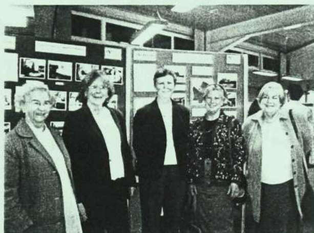
Staff members, mothers and Haven babes had an enjoyable, if emotional evening.

Pictures of Kerala, Yateley (the house's previous name) when in private ownership, taken in 1935.