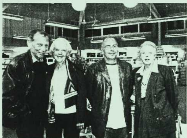
People with links to The Haven travelled from all over the country to be present

“...the best lecture yet...” this was just one of the glowing responses received following to the