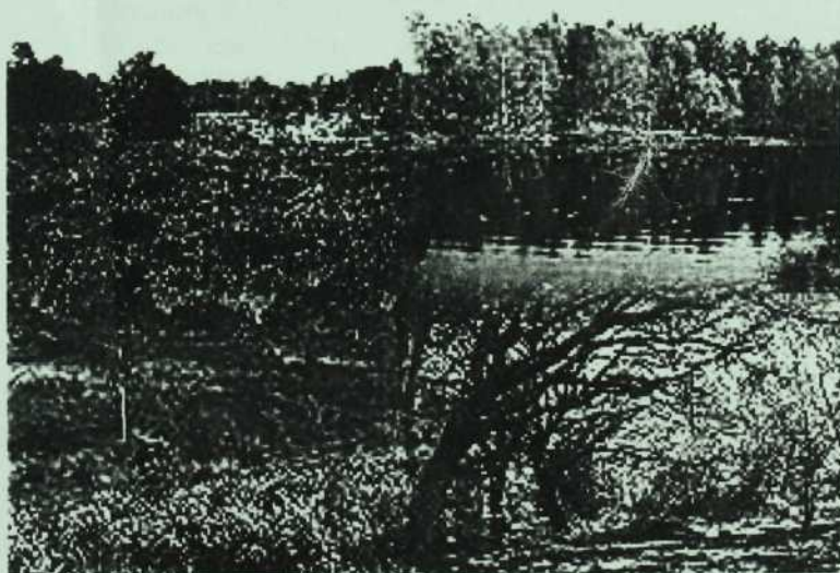
A montage of views of Yateley Common

Investigate the traditional uses, culinary, medicinal and household, of the plants of Yateley Common.